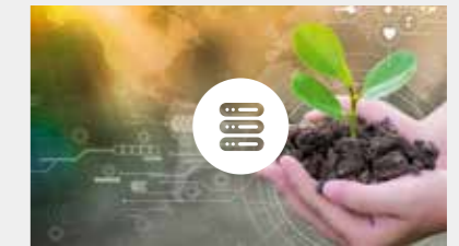
Collaborative national plant phenomics missions